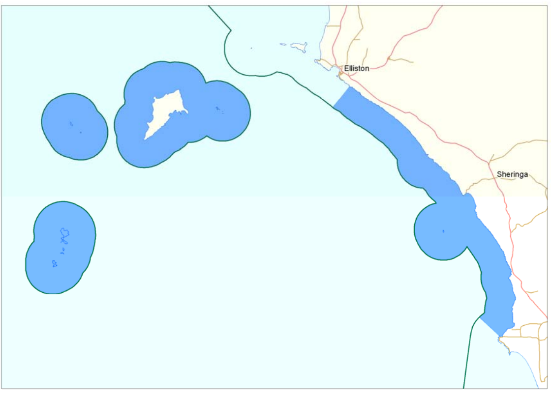
Location of Investigator Marine Park

Located on the west coast of Eyre Peninsula in the Eyre Bioregion, the Investigator Marine Park covers 1,185 km<sup>2</sup> over four areas, including the area south of Elliston to near Point Drummond and the offshore islands of the Investigator Group Conservation Park and Wilderness Protection Area. The Cap Island Conservation Park is also included in the boundaries of this marine park (DENR 2010).