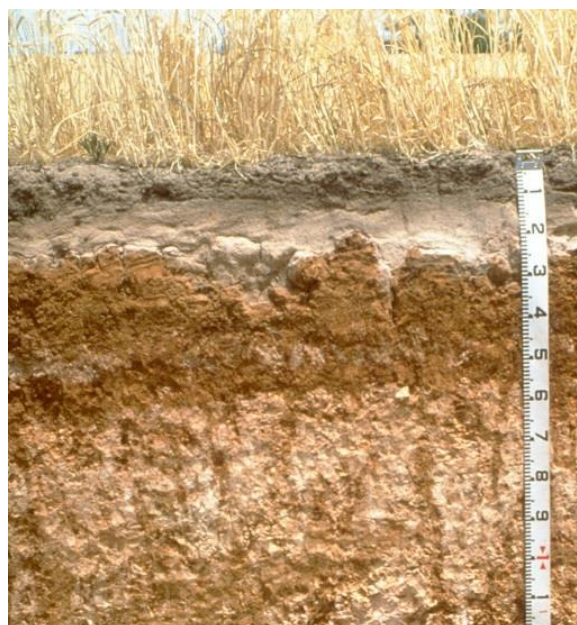
Sand over poorly structured clay (G4) is characterised by low fertility, wind erosion risk and water repellence