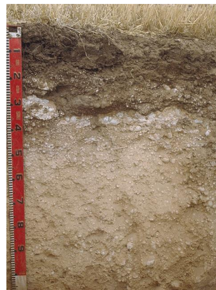
Calcareous loam (A4) soils are the most widespread of 61 classes

Soils (soil type) vary across the landscape due to differences in factors such as parent material, climate, topography, biotic influences and time of formation. Sixty one representative classes of Soils (soil type) have been identified to describe the variation in soils found across southern South Australia. These classes highlight important features for land use and management, and are based on significant profile features observed and recorded by soil scientists during the course of the State Land and Soil Mapping Program (1986–2001). Three miscellaneous classes (rock, water, not applicable) are also recorded.