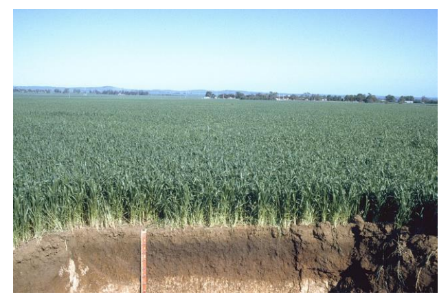
Soil group C: gradational soils with highly calcareous lower subsoil are of considerable agricultural value and include some of the most productive and naturally fertile soils in the state

Soil groups and Soils (soil type) are described in the reference book: 'The Soils of Southern South Australia' (Hall et al. 2009, see link overleaf*).