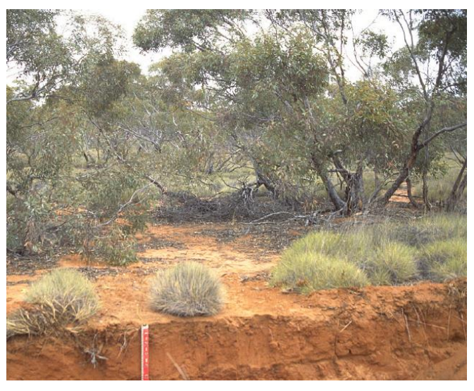
Soil group G: sand over clay, from the northern Murray Plains area