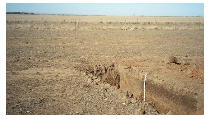
Land affected by boron toxicity

Soil and land attribute maps display a simplified version of the underlying data. Mapping classes are based on an interpretation of soil landscape map units. Each map unit component is assessed according to the average estimated depth to toxic boron (i.e. concentrations exceeding 15 mg/kg). Legend categories are then based on the proportion of each map unit where this occurs within the upper 100 cm of soil.