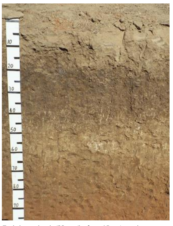
Toxic boron levels (22 mg/kg from 15 cm) restrict root growth

deeper into the soil. Excess boron cannot be removed from soil or treated in any way under dryland farming conditions. Accidental or deliberate breeding for boron tolerance has produced a range of cultivars which are appropriate for affected soils.