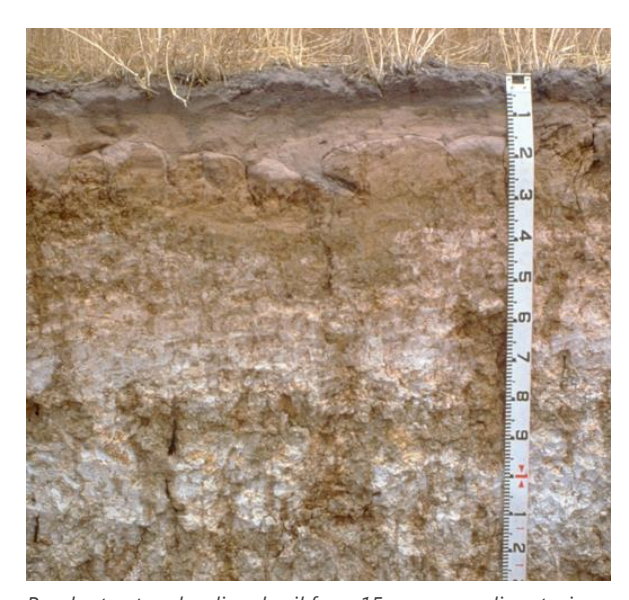
Poorly structured sodic subsoil from 15 cm over sodium toxic clay (exchangeable sodium percentage of 51) from 35 cm

Further information can be found in <u>Assessing Agricultural</u> <u>Land</u> (Maschmedt 2002).