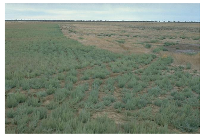
Saline land with near-surface sodium toxicity

Soil and land attribute maps display a simplified version of the underlying data. Mapping classes are based on an interpretation of soil landscape map units within which the depth to highly sodic layers can vary. Each map unit component is assessed according to the estimated average depth to toxic sodium (ESP exceeding 25). Legend categories are determined by highlighting the most severely affected landscape component, provided it occupies at least 30% of the area of the map unit.