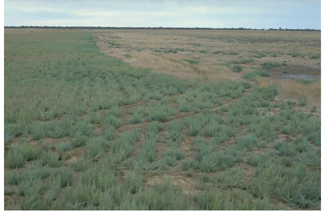
Saline land with near-surface sodium toxicity

Soil and land attribute maps display a simplified version of the underlying data. Mapping classes are based on an interpretation of soil landscape map units within which the depth to highly sodic layers can vary. Each map unit component is assessed according to the estimated average depth to toxic sodium (ESP exceeding 25). Map units are then classified according to the proportion of the map unit area where this occurs within the top 100 cm of soil.