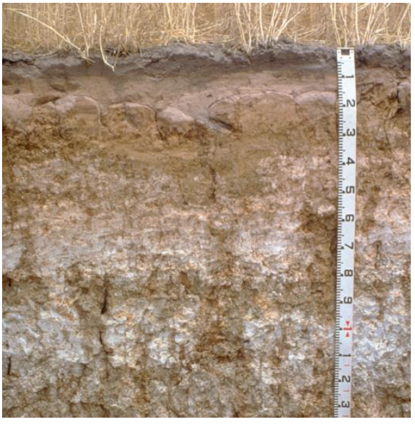
Poorly structured sodic subsoil from 15 cm over sodium toxic clay (exchangeable sodium percentage of 51) from 35 cm

Further information can be found in <u>Assessing Agricultural</u> <u>Land</u> (Maschmedt 2002).