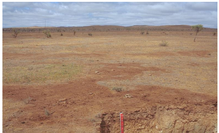
Shallow calcareous loam soil with sporadic scalding

Soil and land attribute maps display a simplified version of the underlying data. Mapping classes are based on an interpretation of soil landscape map units. In this mapping of Scalding , map units are categorised according to the estimated area proportion of affected land.