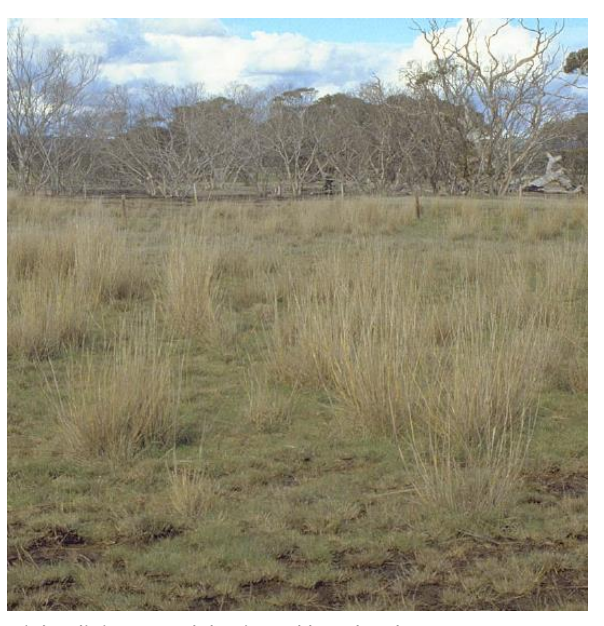
High salinity ground dominated by salt-tolerant grasses

Watertable induced salinity is soil salinity caused by the presence of shallow, saline groundwater, where capillary action brings salts into the rootzone and surface soil. The severity of salinity is primarily determined by the depth to groundwater, groundwater salinity and soil texture. In some districts, salinity occurs as isolated patches (saline seeps) in a landscape which is otherwise unaffected. In other districts, the effects of salinity are more uniform across the landscape.