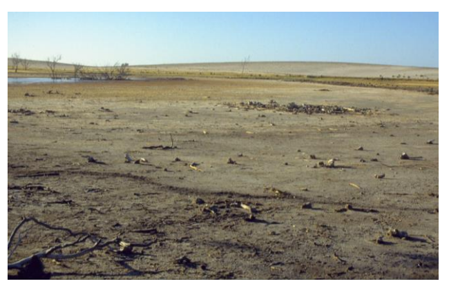
Previously productive land degraded by salinity

Soil attribute maps display a simplified version of the underlying data. Mapping classes are based on soil landscape map units. In this case, map units display the degree of salinity of the landscape as a whole, and the proportion of land affected by discrete highly saline seepages. Map units are ranked according to the severity of salinity and proportion of land affected. The latter criterion is important, as in many landscapes, the distribution of salt affected land is highly erratic.