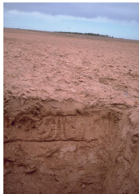
Magnesia ground on far western Eyre Peninsula

Further information can be found in Assessing Agricultural Land (Maschmedt 2002).