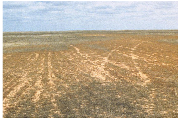
Non-watertable salinity magnesia patch

Soil and land attribute maps display a simplified version of the underlying data. Mapping classes are based on an interpretation of soil landscape map units, which are classified according to the area proportion affected by magnesia patches.