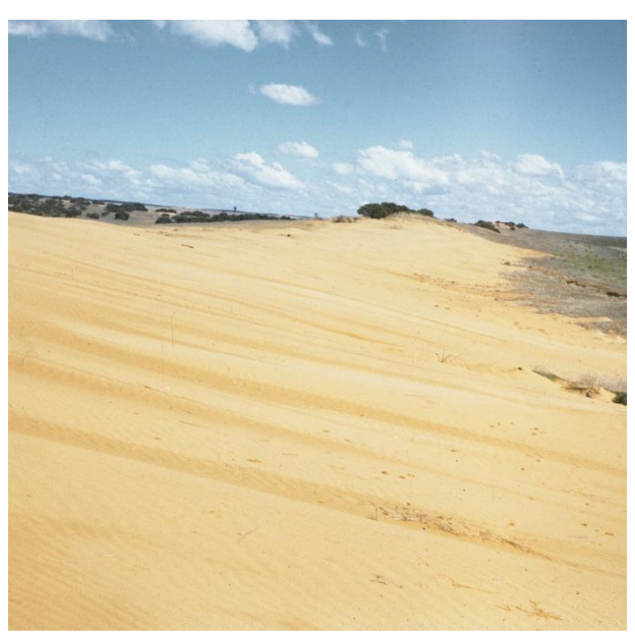
Sandhills are typically high recharge potential zones

Further information can be found in <u>Assessing</u> <u>Agricultural Land</u> (Maschmedt 2002).