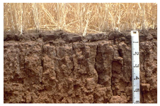
Deep clayey soils typically have low recharge potential

Soil and land attribute maps display a simplified version of the underlying data. Mapping classes are based on an interpretation of soil landscape map units, which often contain different landscape elements of varying Recharge potential . Each map unit has been assigned a mapping class according to the area proportion of high and moderate Recharge potential .