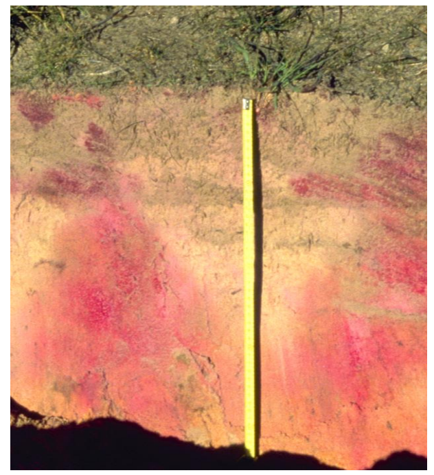
Pink dye applied uniformly at the surface shows uneven wetting patterns in a water repellent sand

Further information can be found in <u>Assessing</u> <u>Agricultural Land</u> (Maschmedt 2002).