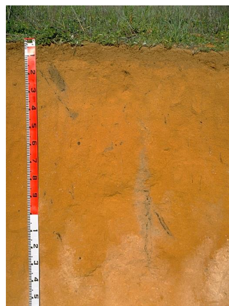
Deep, well drained sand — ideal for citrus trees

Further information can be found in Assessing Agricultural Land (Maschmedt 2002).