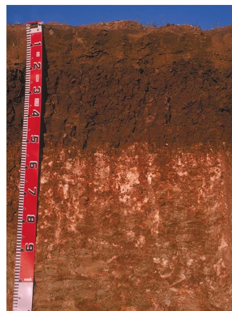
Deep loam over slightly restrictive subsoil — no limitation for intermediate perennials

Further information can be found in Assessing Agricultural Land (Maschmedt 2002).