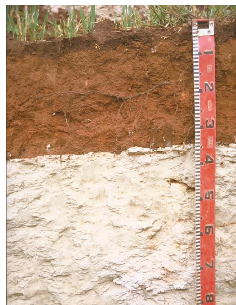
Shallow loam on limestone — restrictive for most crops but ideal for grape vines

Further information can be found in Assessing Agricultural Land (Maschmedt 2002).