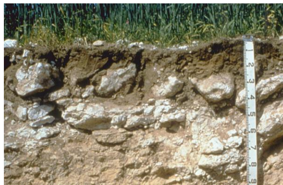
Calcrete often overlies sodic and highly calcareous materials, or tight heavy clays, all of which limit potential rootzone depth

Soil and land attribute maps display a simplified version of the underlying data. Mapping classes are based on soil landscape map units, within which rootzone depth potential can vary. Map units are classified according to the estimated potential rootzone depth of the component soils, on a weighted average basis. Variations from the mean can be significant, so legend categories should be considered as indicative only.