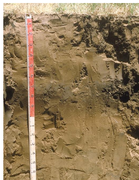
Deep, well drained, stone-free sandy loam — ideal for root crops

Further information can be found in Assessing Agricultural Land (Maschmedt 2002).