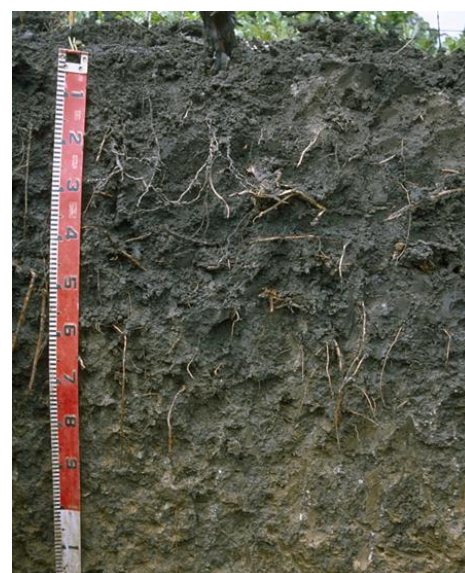
Deep, friable, fertile clay loam with non-restrictive subsoil — ideal for vegetable crops

Further information can be found in Assessing Agricultural Land (Maschmedt 2002).