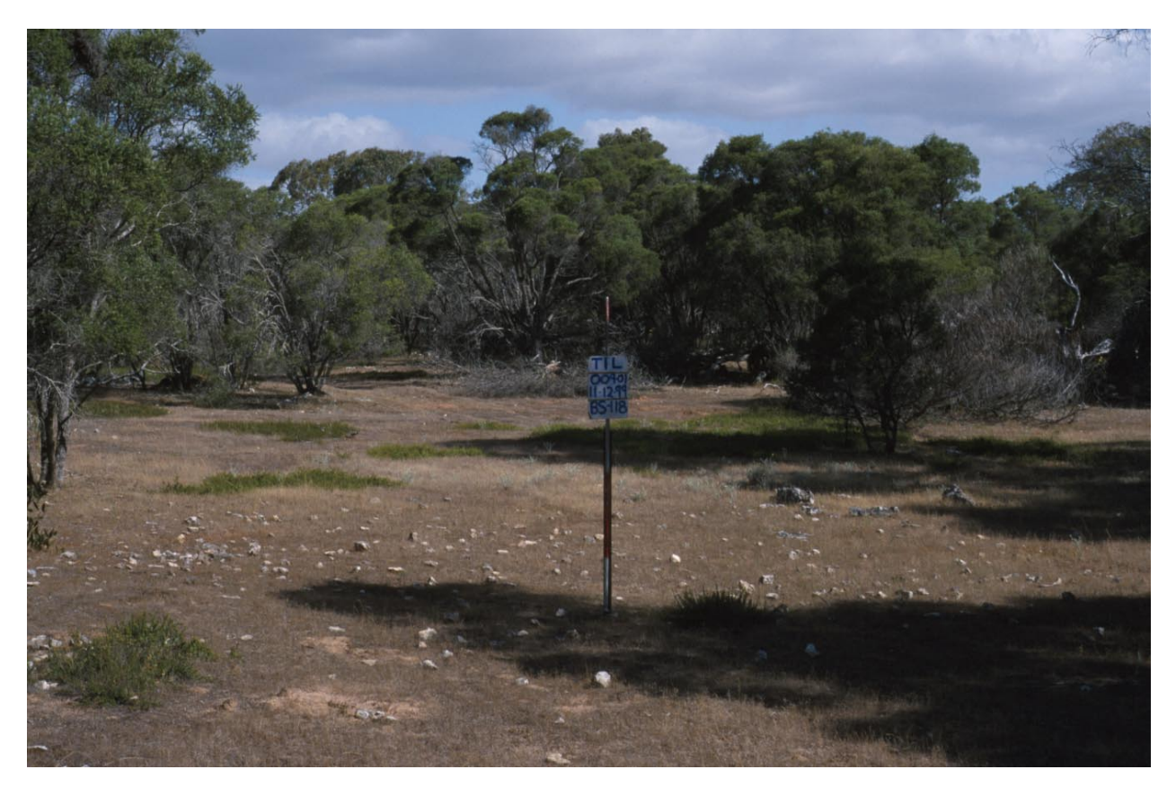
Figure 12. TIL00901 Melaleuca lanceolata Low woodland.