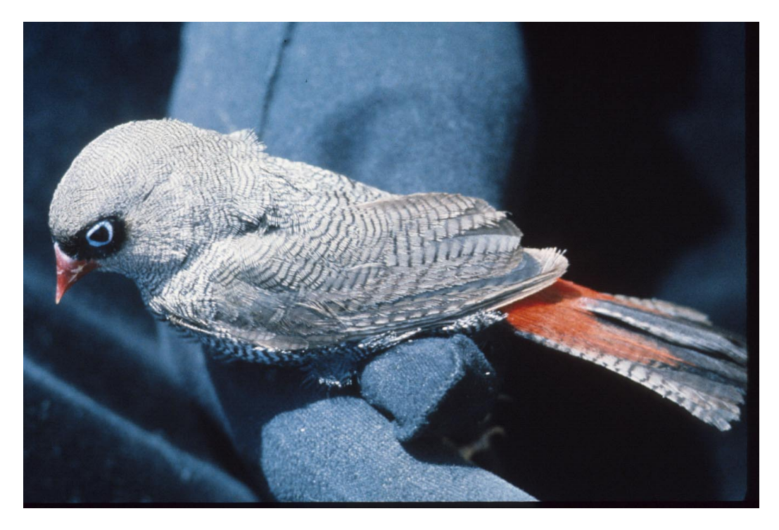
Figure 17. A Beautiful Firetail was observed during the Biological Survey of the West Avenue Range in Melaleuca brevifolia Low shrubland. Drainage works may have an adverse affect on this type of habitat.

Figure 16. The 'rare' and secretive Southern Emu-wren (Stipiturus malachurus) has declined in many areas due to the affects of introduced predators, drainage and habitat clearance.