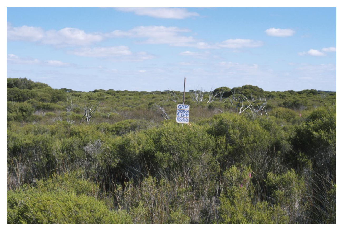
Figure 8. GYP00501 Melaleuca brevifolia Low shrubland.