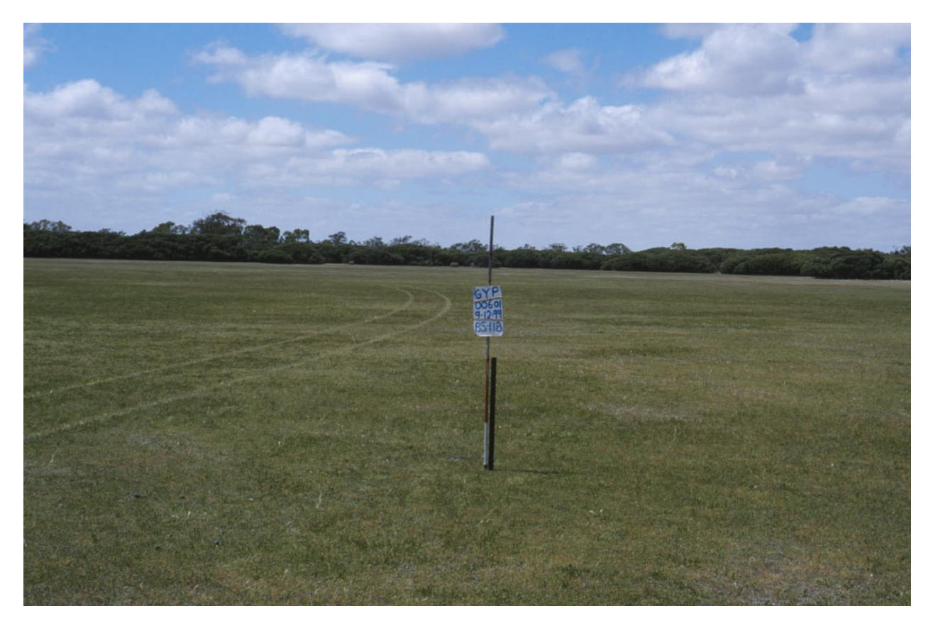
Figure 9. GYP00601 Selliera radicans Herbland.