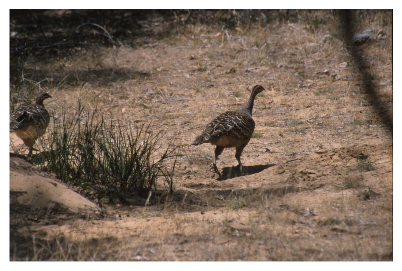
Figure 14. A pair of Malleefowl photographed while working a mound nest in the West Avenue Range in December 1999.