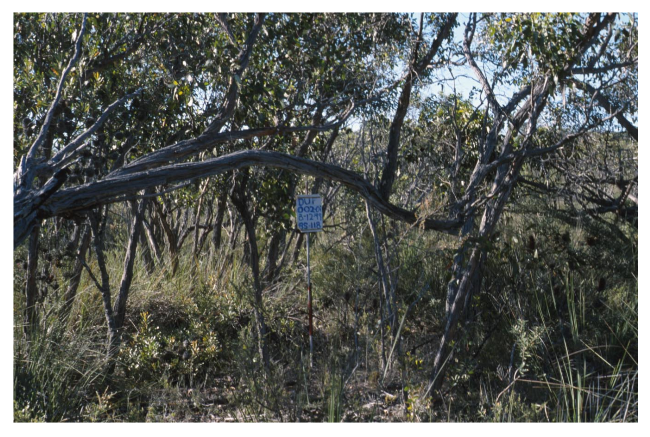
Figure 5. DUF00201 Eucalyptus arenacea Low open woodland.