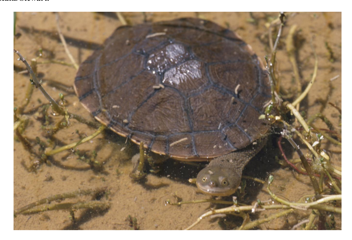
Figure 22. The Common Long-necked Tortoise (Chelodina longicollis) colonises the wetland areas of the West Avenue Range during flood events. Photo. Hafiz Stewart.

Figure 21. This beautifully marked Brown Tree Frog (Litoria ewingi) was collected opportunistically from damp soil around the base of a water tank. Photo. Hafiz Stewart.