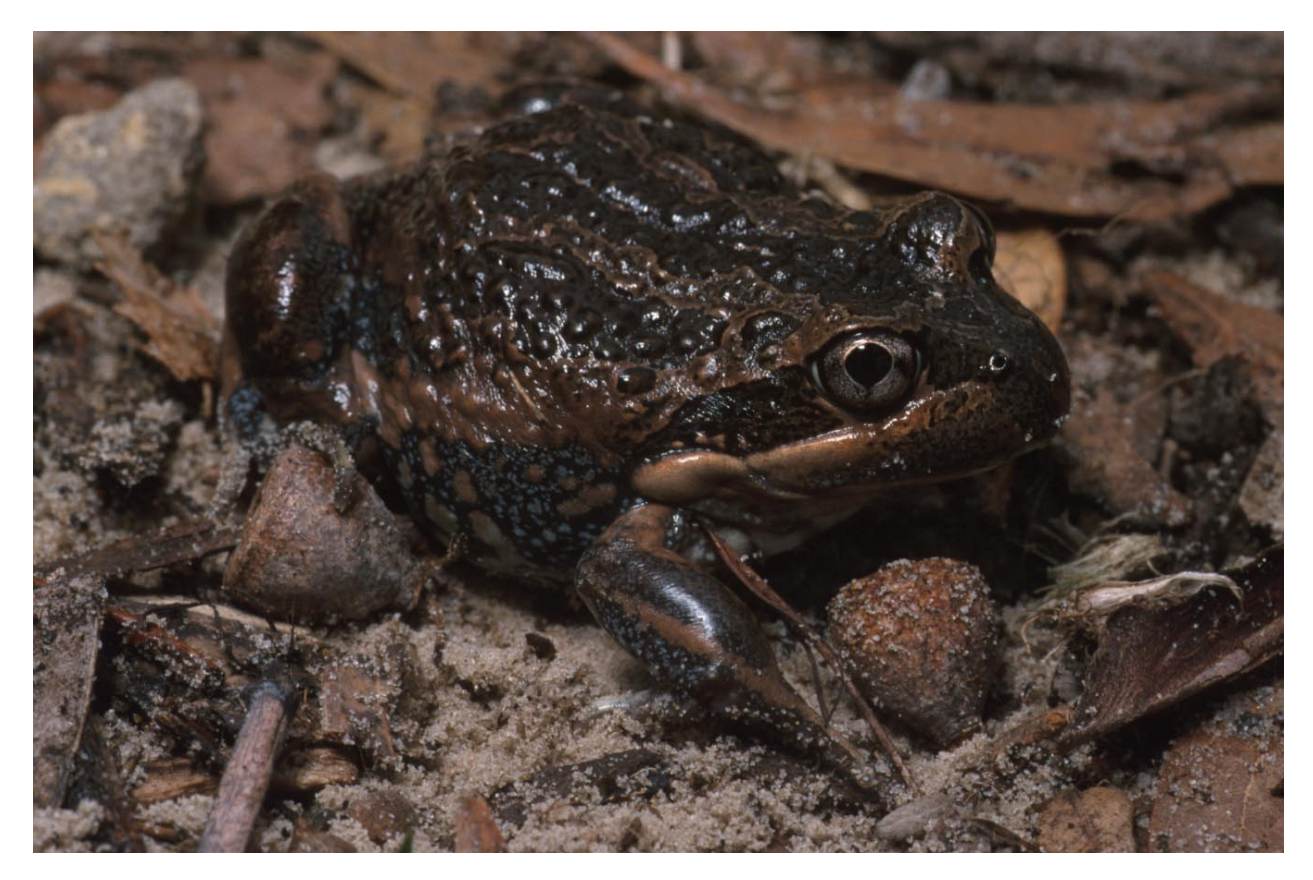
Figure 20. The Bull Frog (Lymnodynastes dumerili) one of the 'burrowing frogs'.