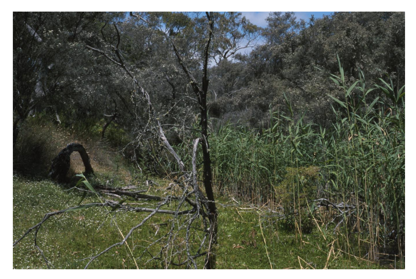
Figure 2. The Henry Creek, West Avenue Range, December 1999.