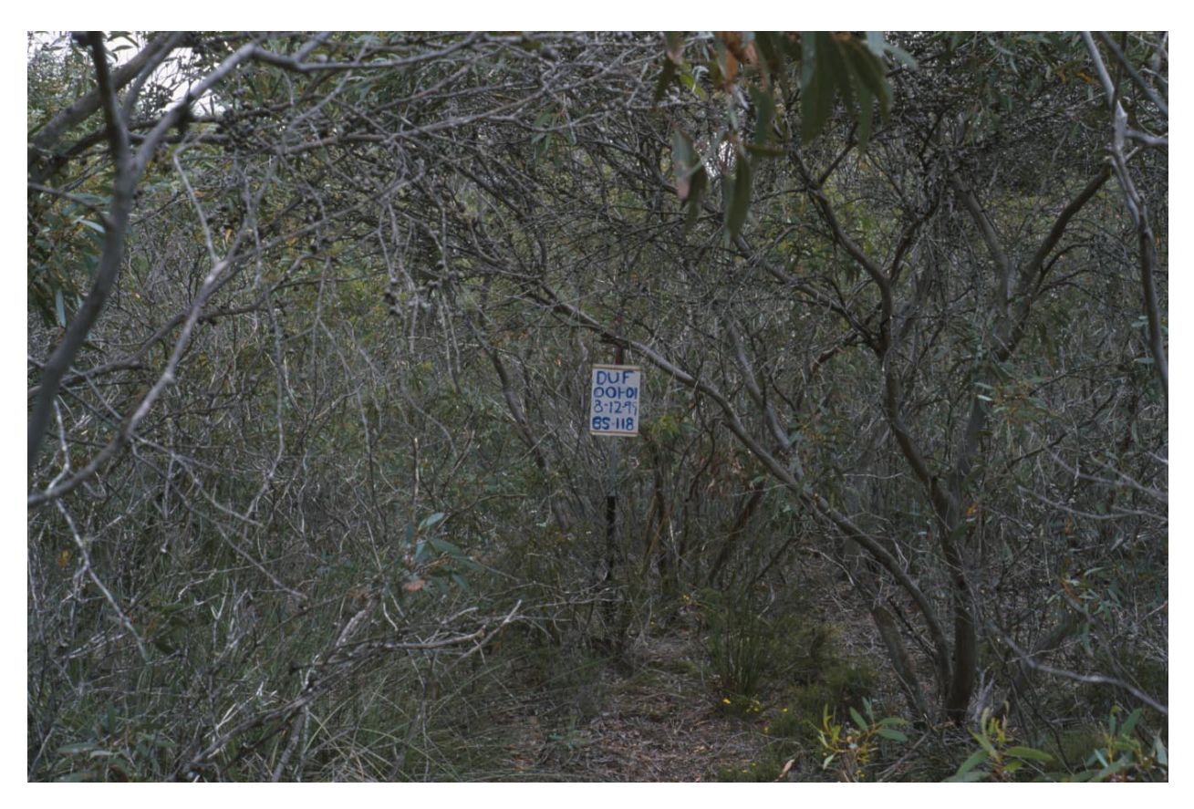
Figure 4. DUF00101 Eucalyptus diversifolia Mallee.