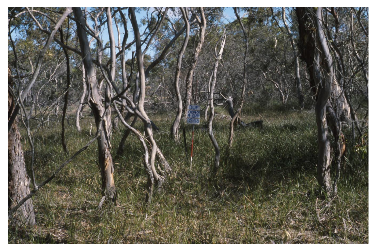
Figure 7. DUF00401 Eucalyptus leucoxylon Low open woodland.