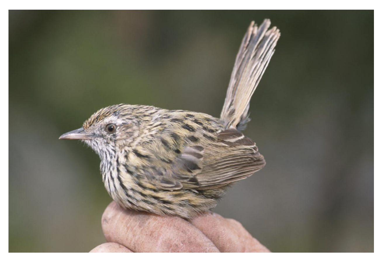
Figure 18. The Striated Fieldwren (Calamanthus fuliginosus) prefers Melaleuca spp. shrubland. Drainage works may have an adverse affect on this type of habitat.