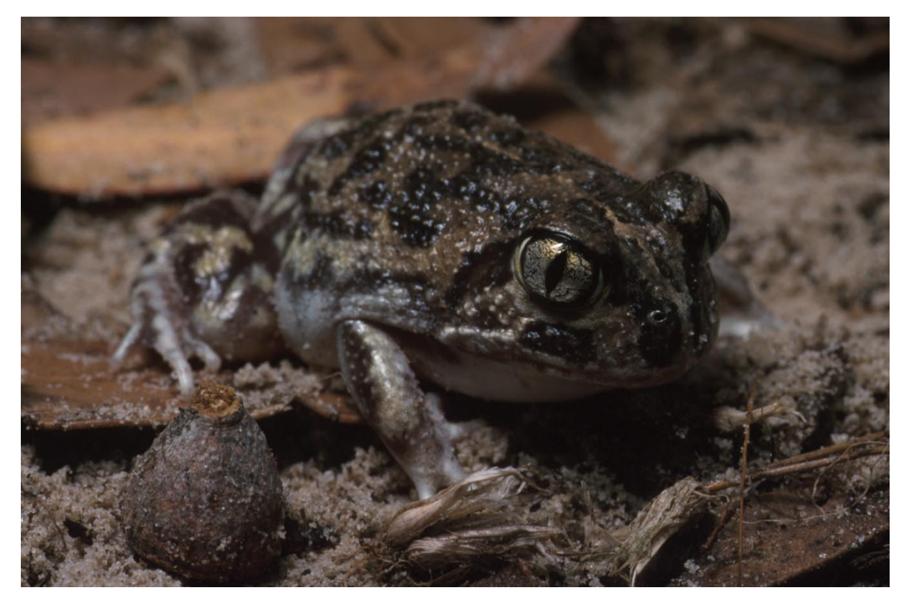
Figure 19. The Meeowing Frog (Neobatrachus pictus) one of the 'burrowing frogs'.