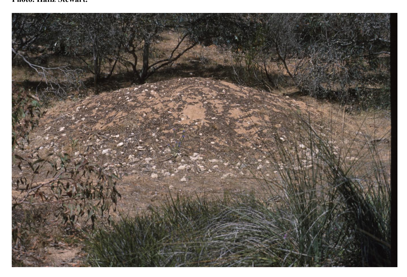
Figure 15. A Malleefowl mound nest photographed in the West Avenue Range in December 1999. Photo. Hafiz Stewart.

Figure 14. A pair of Malleefowl photographed while working a mound nest in the West Avenue Range in December 1999. Photo. Hafiz Stewart.