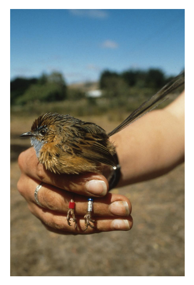
Figure 16. The 'rare' and secretive Southern Emu-wren (Stipiturus malachurus) has declined in many areas due to the affects of introduced predators, drainage and habitat clearance.