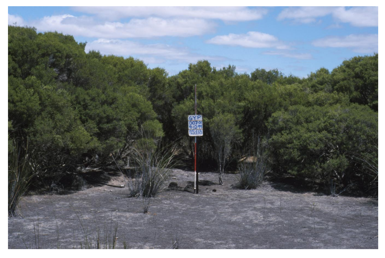
Figure 10. GYP00701 Melaleuca halmaturorum Tall shrubland.