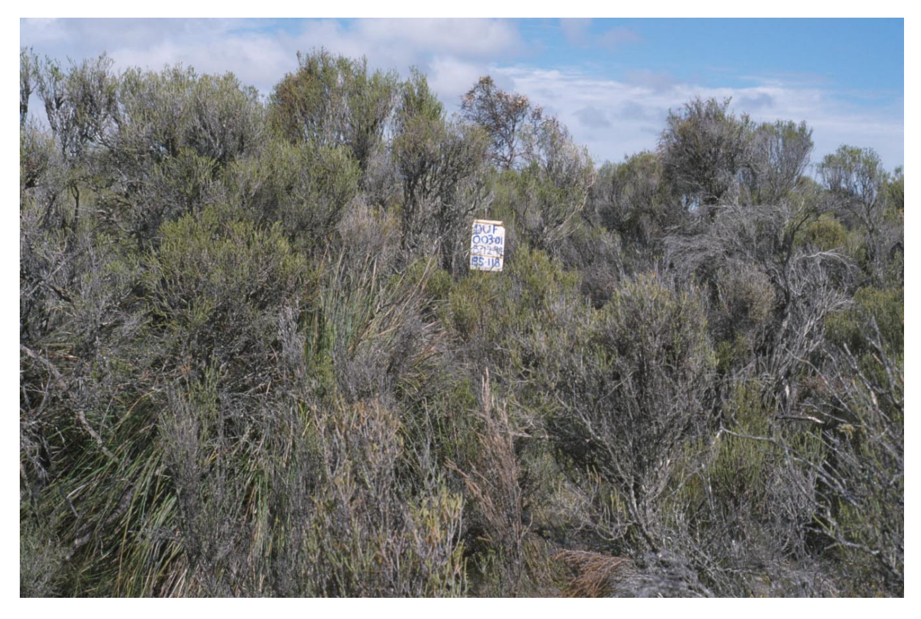
Figure 6. DUF00301 Melaleuca brevifolia Low shrubland.