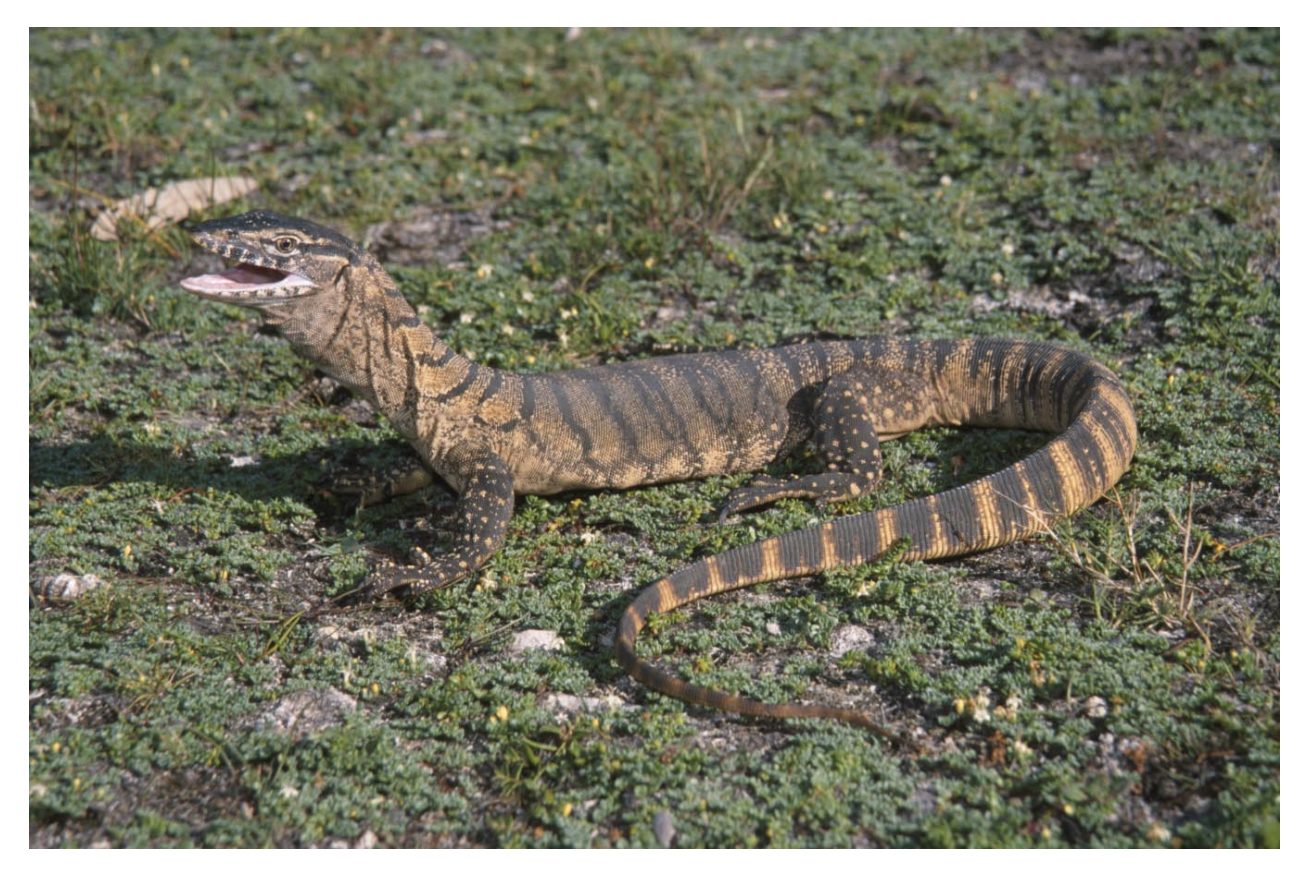
Figure 23. The Heath Goanna (Varanus rosenbergi) is considered 'rare' in South Australia.