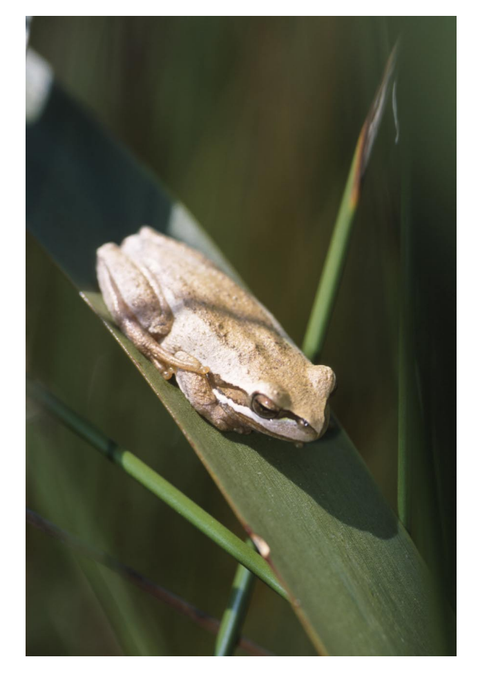
Figure 21. This beautifully marked Brown Tree Frog (Litoria ewingi) was collected opportunistically from damp soil around the base of a water tank.