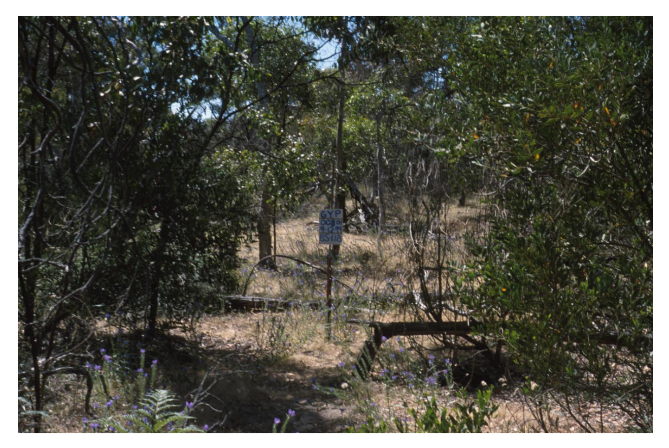
Figure 11. GYP00801 Eucalyptus fasciculosa Low woodland.