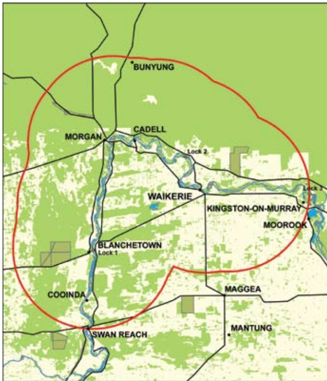
Map of boundary area