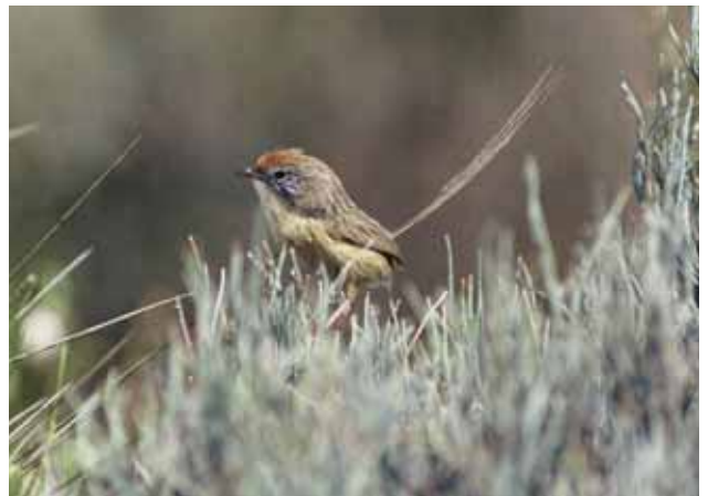
A female Mallee Emu-wren on an Allocasuarina shrub.

Mallee Emu-wrens occur in the mallee and heaths of the Murray-Darling Basin in South Australia and Victoria, to the south and east of the river. They have been declining in South Australia for some time and are now largely restricted to Ngarkat and Billiatt Conservation Parks (see map).