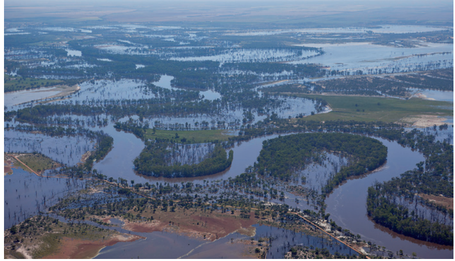
Western corridor of Pike Floodplain inundated.