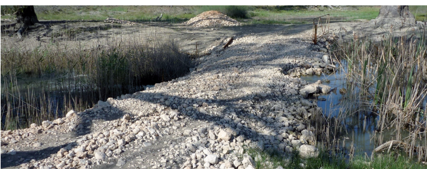
Bank F: one of the crude earthen embankments identified to be upgraded as part of the RRP.

New infrastructure will assist in reinstating variable flow and water levels and fish passage throughout the Pike anabranch complex.