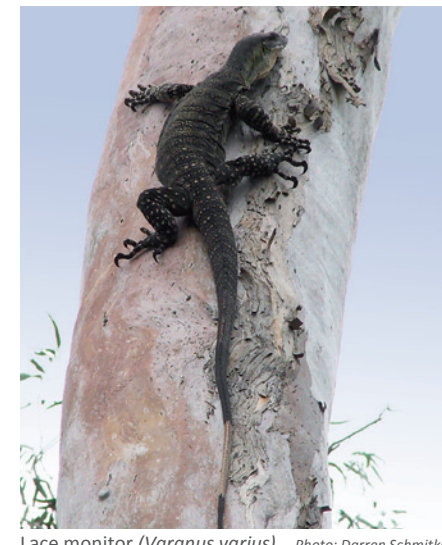
Lace monitor (Varanus varius).