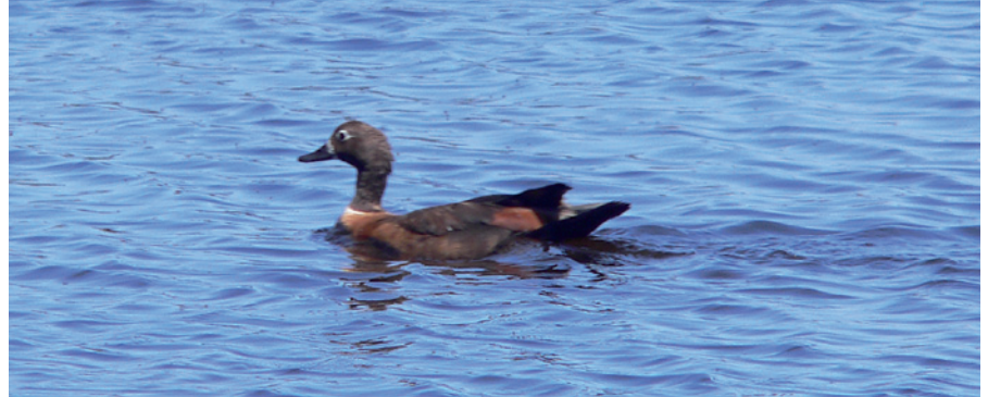
Chestnut teal (Anas castanea).

The Pike Floodplain project will continue to work with local communities to encourage ongoing participation in floodplain management activities.