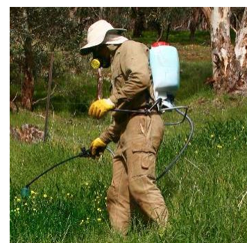
Trends in the application of risk management

This report summarises information on the management of invasive species and should be read alongside reports on distribution and abundance of weeds and pest animals in the NRM region.