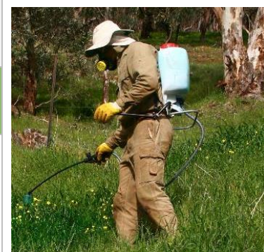
Trends in the application of risk management

This report summarises information on the management of invasive species and should be read alongside reports on distribution and abundance of weeds and pest animals in the NRM region.