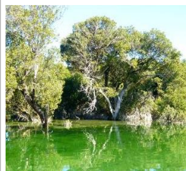
Trend in the extent and condition of mangroves

The health of mangrove ecosystems relies on the management of coastal development and water quality within catchments.