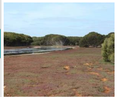
Trends in saltmarsh extent and condition

The health of saltmarsh habitats relies on the management of recreational activities, coastal development, stock grazing pressure and water quality within catchments.