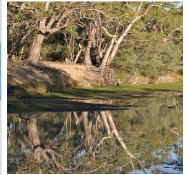
Trends in the percentage of River Murray water flow targets that were met

This report should be read alongside others on the salt flushed out of the Murray Mouth, the ecological condition of the river and water quality for irrigation, recreation and domestic supply.