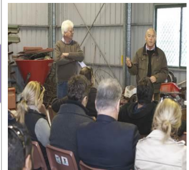
Trends in the number of NRM learning activities

For more information on regional programs to improve awareness of natural resource management issues and priorities, please refer to the NRM Board website .