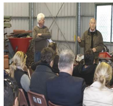
Trends in the number of NRM learning activities

For more information on regional programs to improve awareness of natural resource management issues and priorities, please refer to the NRM Board website .