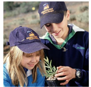
Trends in the engagement of school students in Natural Resources Management

Natural Resource Management (NRM) education programs are effective in creating positive changes in attitude and behaviour towards the environment and assist students and their families to use their new environmental knowledge in their daily lives at home and in the community.