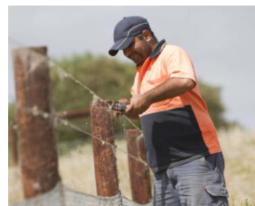
Trend in involvement of Aboriginal people in natural resource management

In South Australia the unemployment rate of Aboriginal people was about three times higher than for non-Aboriginal people, between 2005-11. The Government of South Australia aims to increase Aboriginal employment in all public sector agencies to at least 2 per cent across all levels. DEWNR has an additional target of at least 3 per cent.