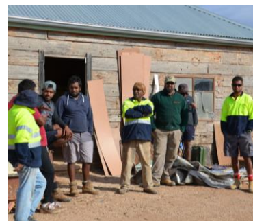
Trend in involvement of Aboriginal people in natural resource management

In South Australia the unemployment rate of Aboriginal people was about three times higher than for non-Aboriginal people, between 2005-11. The Government of South Australia aims to increase Aboriginal employment in all public sector agencies to at least 2 per cent across all levels. DEWNR has an additional target to increase Aboriginal employment by 20 per cent by 2018 in the Alinytjara Wilurara NRM region, including contractors and casual staff.