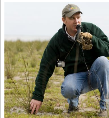
Trend in involvement in NRM training activities

Training typically focuses on the needs of landholders and the community, with courses often covering pest plant and animal control, threatened species and habitat protection, re-vegetation, bushfire prevention, farming improvement practices, and other water and land management practices. Other training events focus on improving environmental awareness of the broader community, students and teachers.