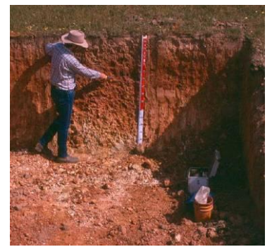
Trend in soil organic carbon storage

Carbon is also stored in native vegetation, as reported here .