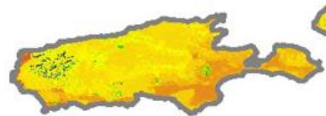
Estimated 0-30 cm soil organic carbon stocks (tonnes per hectare)

New predictive methods may be used in the future to provide more cost effective assessments of changes in soil organic carbon.