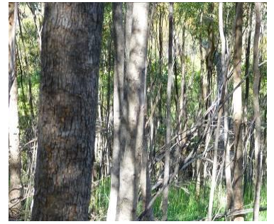
Trends of carbon storage in remnant native trees

Carbon is also stored in the soil, as reported here .