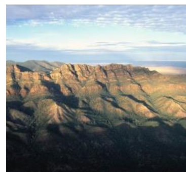
Trends in the condition of geological features

The condition of geological heritage sites may be diminished by inappropriate land use and development, or unrestricted access to vulnerable landforms. It is important to note the value of some features can be enhanced by mining excavation or civil constructions as well.