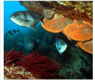
Regional trends in the condition of subtidal reefs

Improvement of reef condition requires management of water quality within catchments, and management of marine pests and physical disturbance.