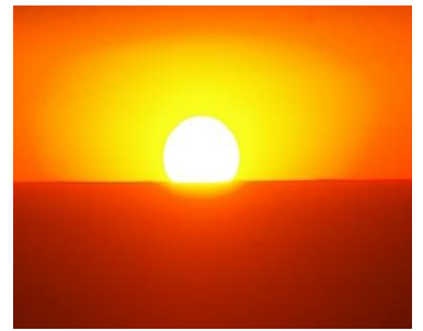
Year 2090: Projected changes in temperature and rainfall

Without careful planning changes in temperature and the amount and frequency of rain, will affect our drinking water supplies and our primary industries. Sea levels around South Australia have been rising by almost five millimetres each year. The upper estimate for 2100 sea levels are 1.1 metres higher than in 1990, potentially affecting 60,000 coastal buildings and 6763 kilometres of roads and other assets, valued at over A$45 billion.