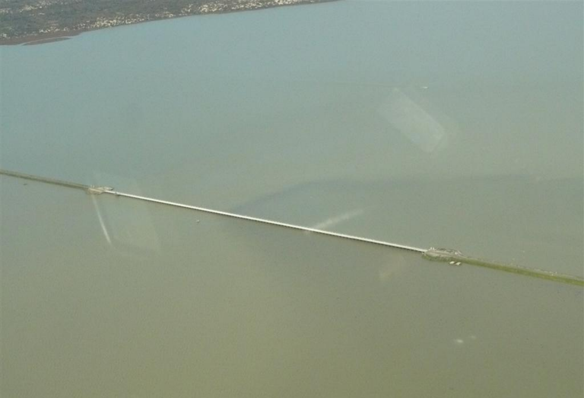
Ewe Island Barrage