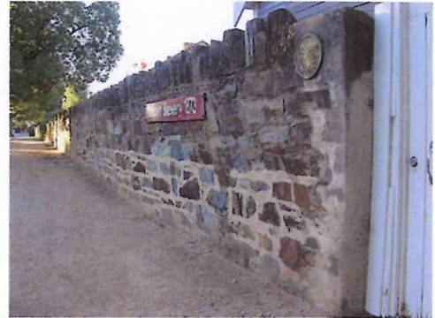
Entrance to Unicorn Brewery, 2005

In 1873 the erection of a new brewery in Burra probably seemed a risky venture. Although the Burra Mine was still working, the number of miners employed there had dropped from 1 000 in the early 1860s to less than 300, and the town's population had fallen to 3 000, with more mining families leaving each week. There were still nine hotels open in the townships, but these were supplied by another, long-established brewery in Burra.