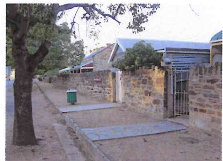
Brewery wall and entrance, 2005

A Commonwealth Act that came into force on 1 January 1902, stated that "No person shall make beer unless licensed to do so." The new regulations were so stringent, and the required paperwork so involved, that only the larger breweries could afford to comply.