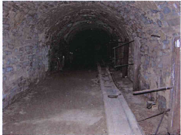
Underground tunnel, 2005

Massive timber beams support the flooring of the storeroom at ground level.