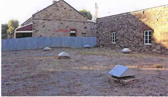
Cellar vents and school residence, 2005

The sale of the brewery buildings and machinery proved difficult, and for many years the complex remained deserted.