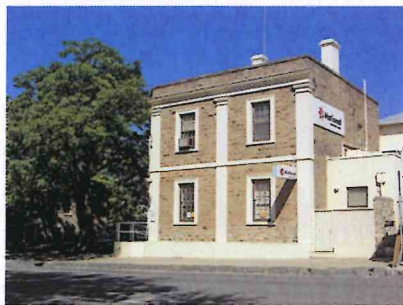
National Bank, 2005