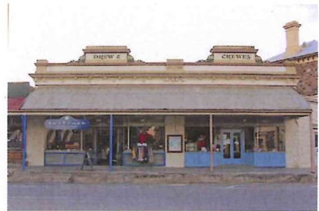
Drew & Crewe's Store, 2005