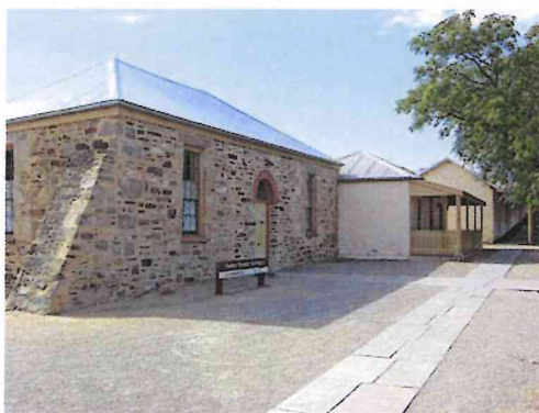
Office, Paxton Square Cottages, 2005

SAHR 10013 – confirmed as a State Heritage Place 8 November 1984