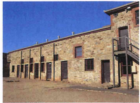
Cell Block, 2005

The National Trust now maintains the building. In 1979 Breaker Morant was filmed in and around Burra, with the Redruth Gaol one of the major locations.