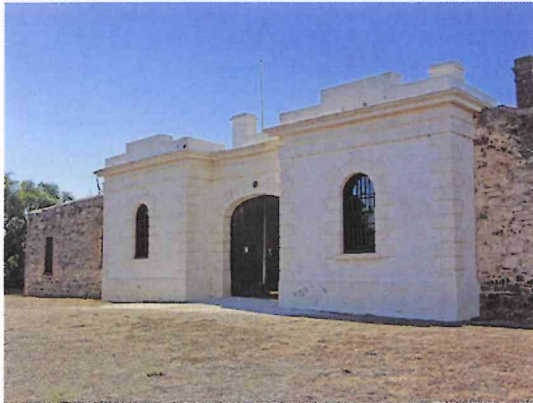
Former Redruth Gaol, 2005

SAHR 10042 – confirmed as a State Heritage Place 24 July 1980