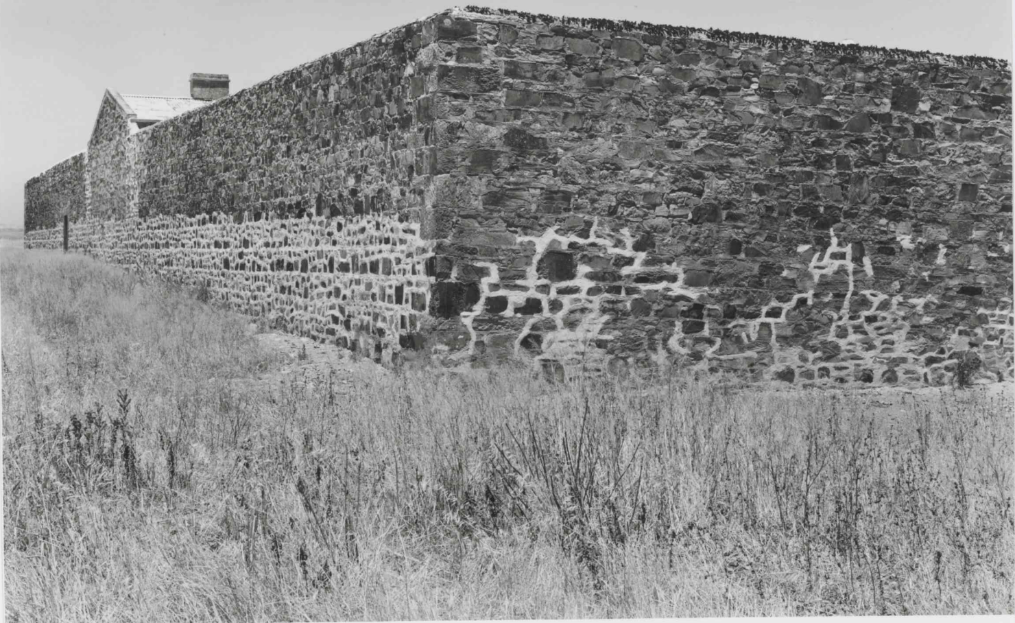
FILM 17 VIEW ALONG NORTH WALL, FORMER NO 4 REDRUTH GAOL