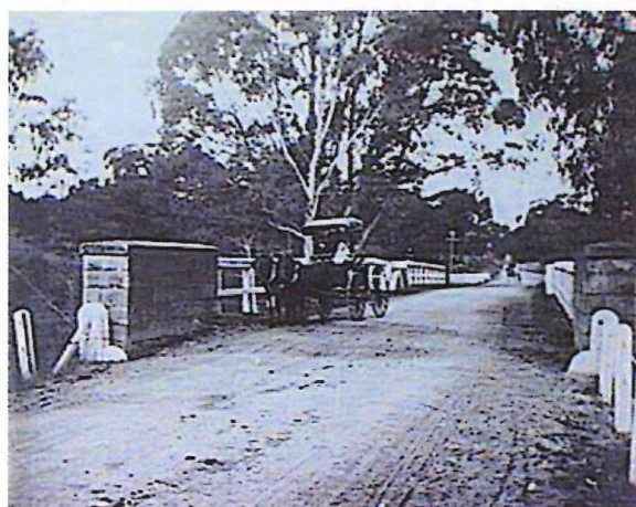
Horse and Trap at Mintaro 1901 Photo B 43380: State Library of SA