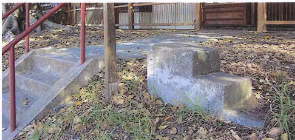
Mounting Steps in front of 'Mintaro Mews', 2005

SAHR 10069 – confirmed as a State Heritage Place 27 November 1981