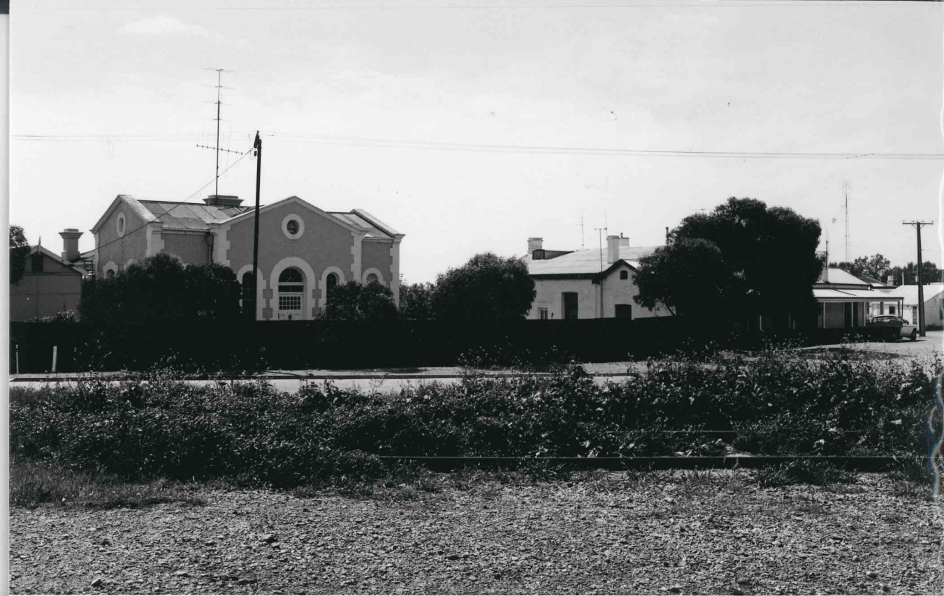
6430- 12516 Customs House and Assay Office, Wallaroo Film 1310 17 Sep 86