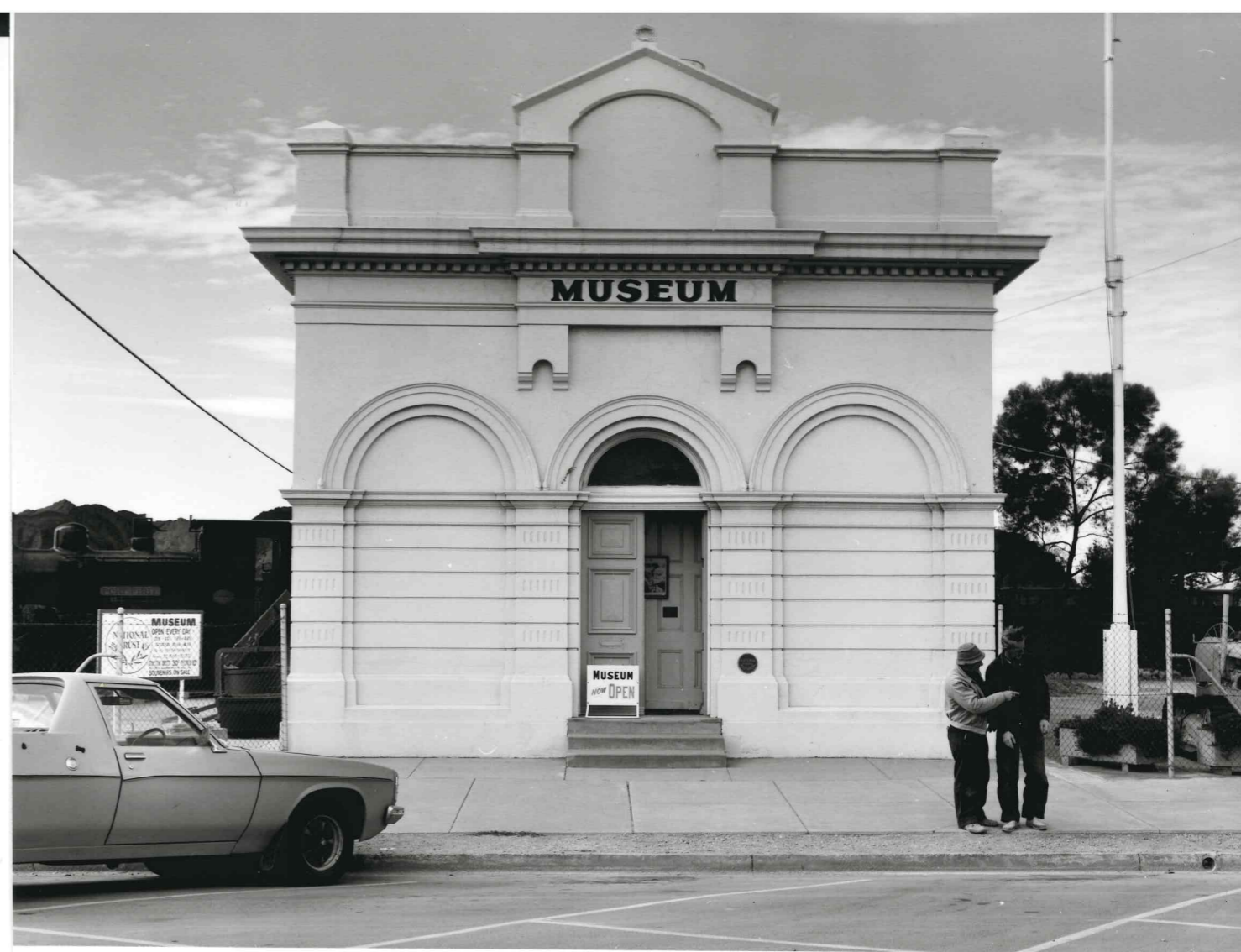
FILM 98 FORMER CUSTOMS HOUSE 69-71 ELLEN ST. PORT PIRIE No 6 FROM WEST 20-7-79