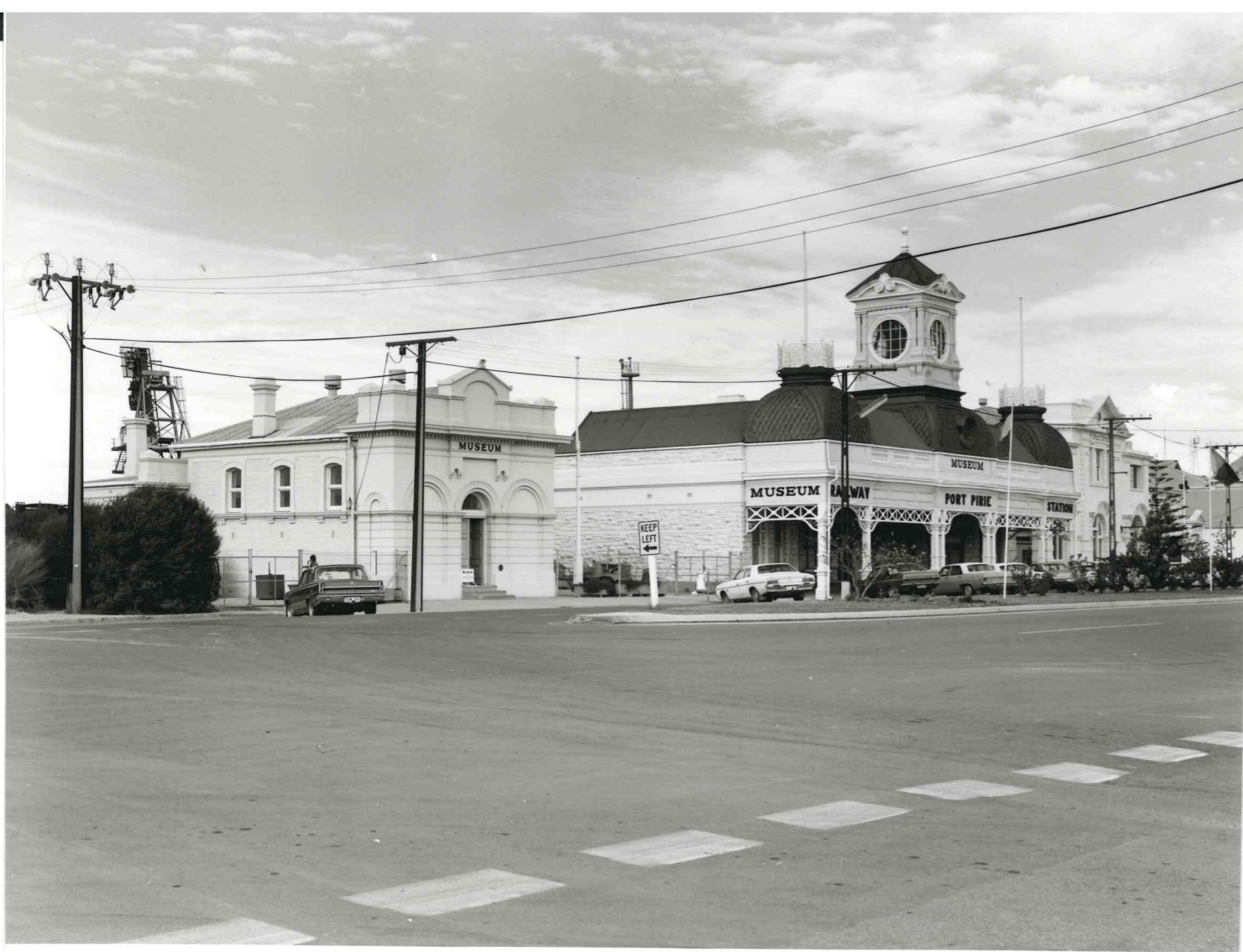
FILM 98 CUSTOMS HOUSE MUSEUM AND RAILWAY No 5 STATION MUSEUM FROM NORTH WEST