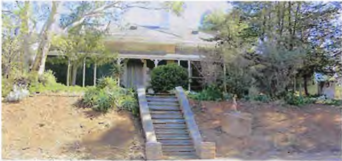
Former Police Station, 2005

SAHR 10205 – confirmed as a State Heritage Place 5 April 1984