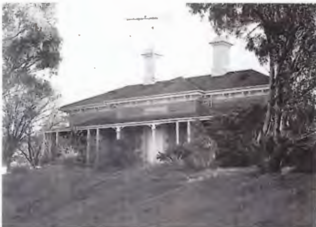
Mintaro Police Station, 1982

The slate building, erected by the Colonial Architect's Office to W. Hanson's design, is a sophisticated example of a police station for that period. It is one of three stations built to the same design (others being at Callington and Truro), but remains the most intact.