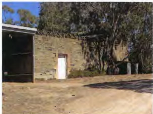
Cells at rear, 2005