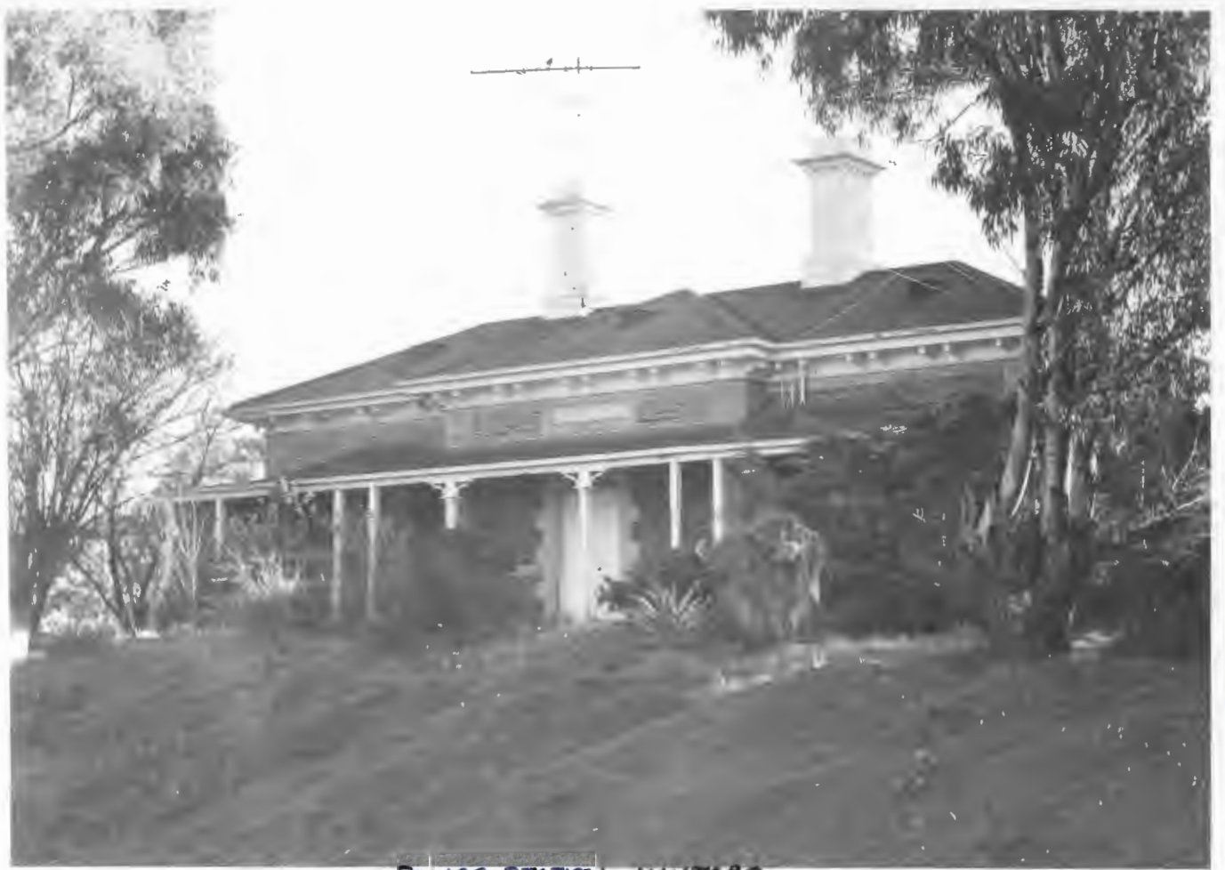
POLICE STATION HAWAII