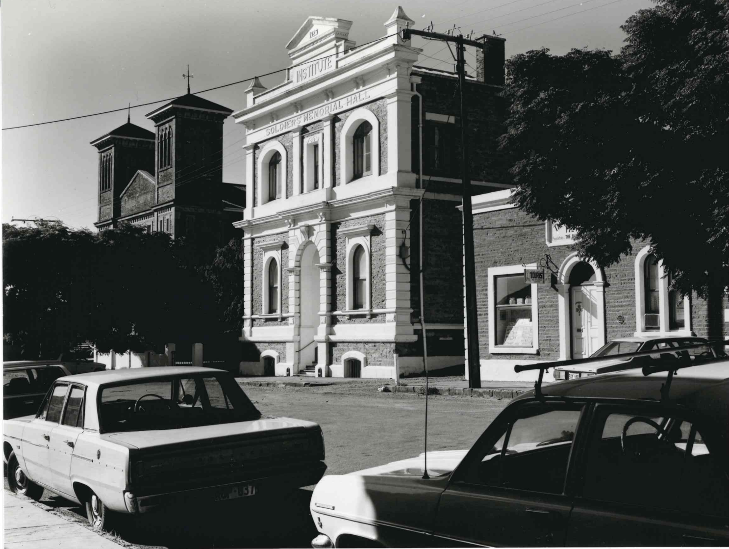
FILM 27 HILL ST VIEW, WITH PRINTING OFFICE, KAPUNDA NO 9 SOLDIERS MEMORIAL HALL AND FORMER BAPTIST CHURCH 30-1-79