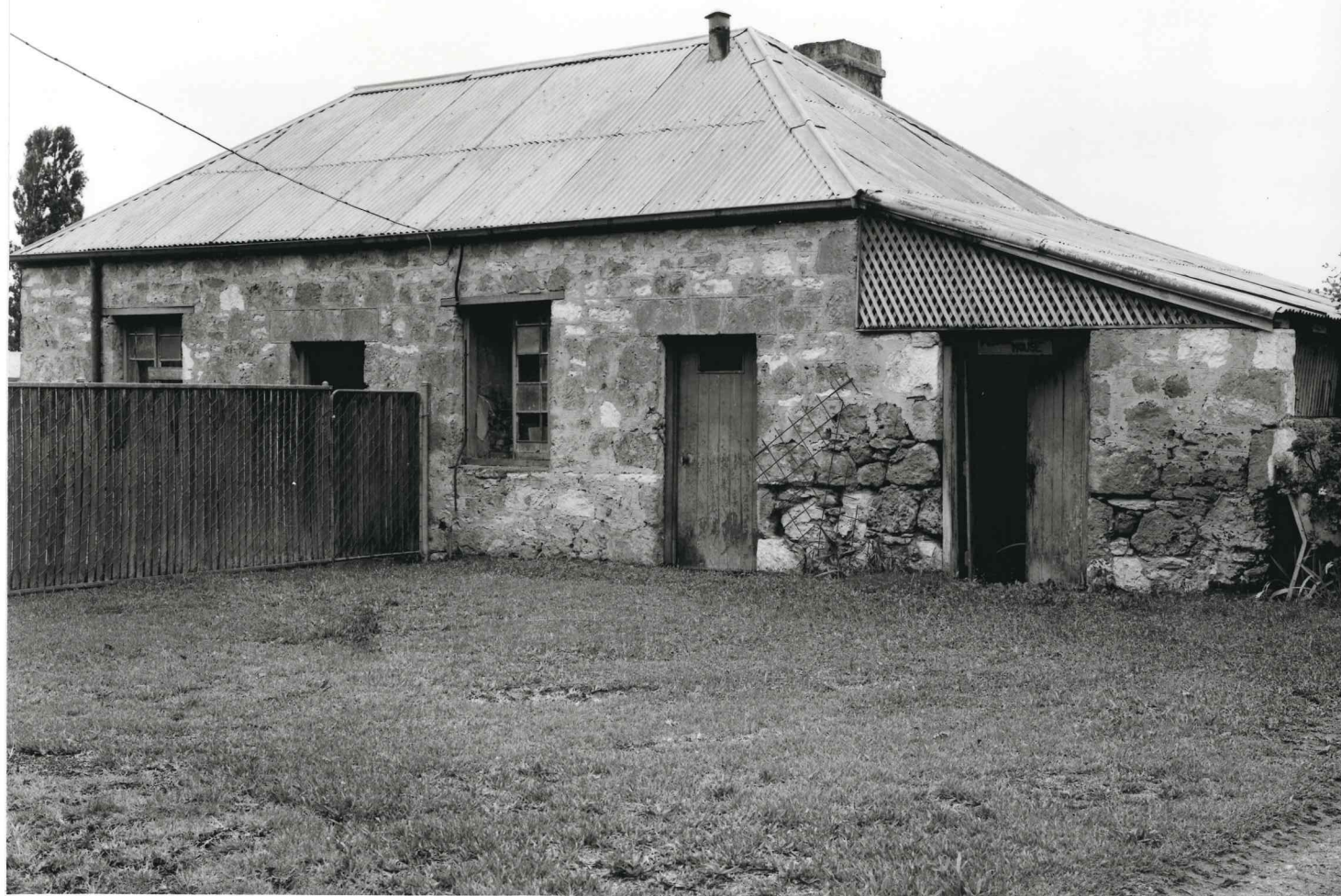
FILM 58 "AUSTIN COTTAGE" (YALLUM PARK) No 5 FROM SOUTH WEST EAST