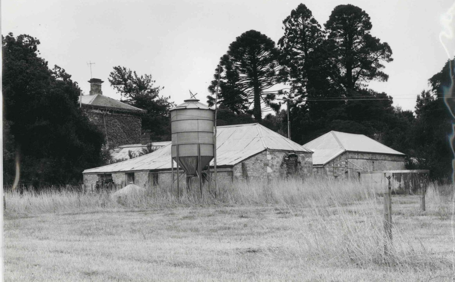
FILM 58 "YALLUM PARK" STAGES 1 AND 2 WITH No 6 STAGES 3 AND 4 BEHIND