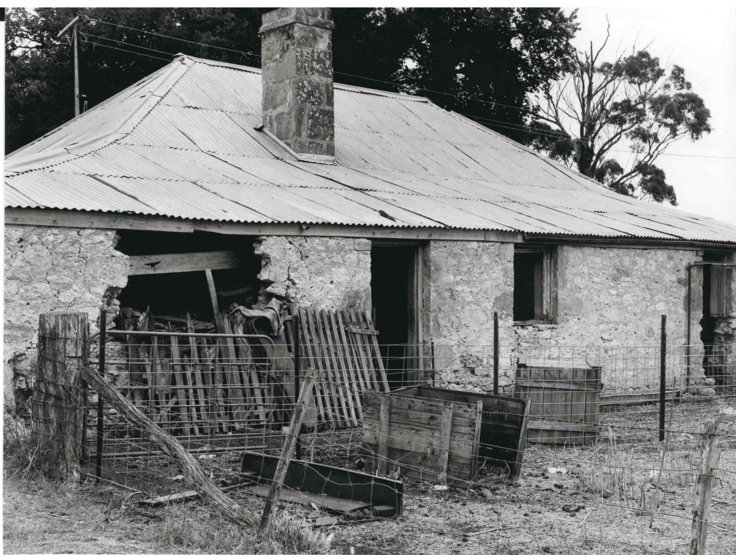
FILM 58 "AUSTIN COTTAGE" (YALLUM PARK) NO 7 EAST WALL