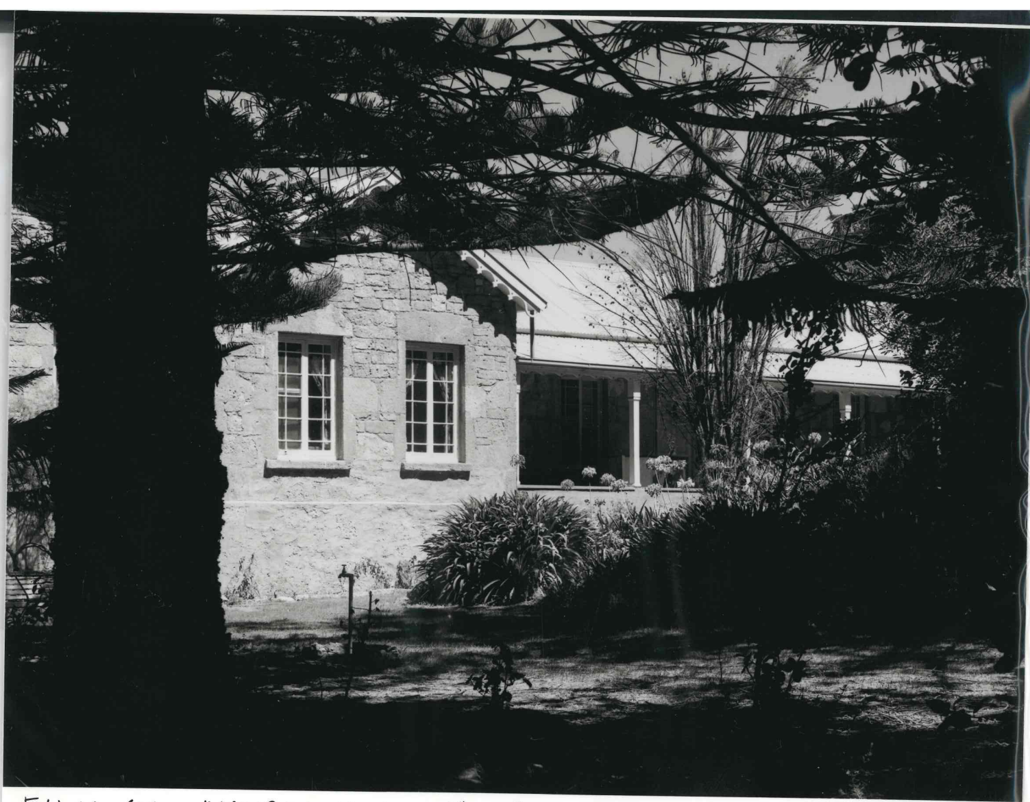
FILM 47 "MOORAKYNE HOUSE" FROM NORTH NO 6