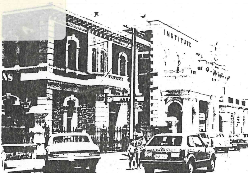
G11 - GAWLER INSTITUTE Murray Street Gawler Built 1870.

Italianate building with wall of bluestone rubble with stone dressings. Cast iron balustrade to portico at street level bears an interesting inscription as follows:-