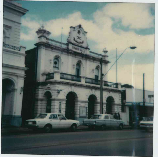
GAWLER COUNCIL CHAMBERS MURRAY ST. GAWLER JULY '79. MAB.